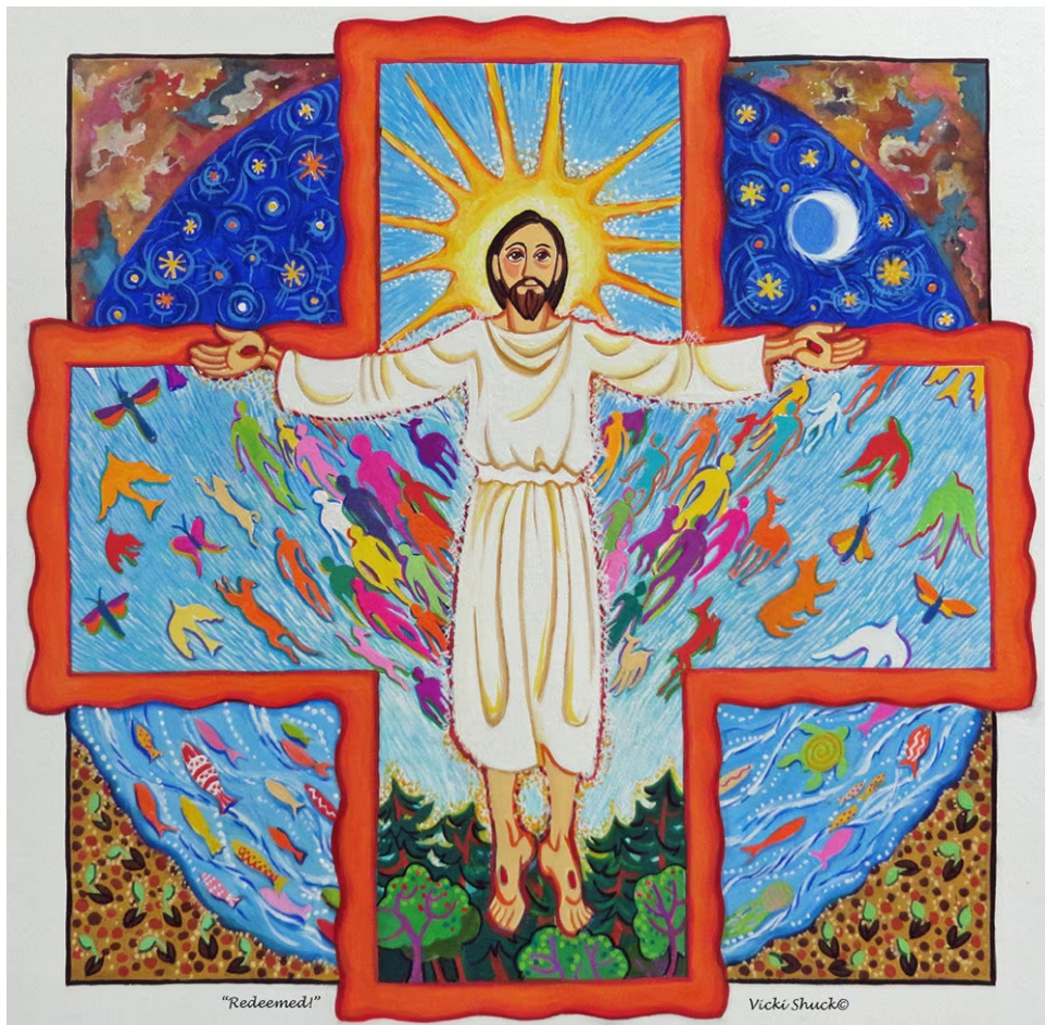
"Redeemed" (2016) by Vicki Shuck