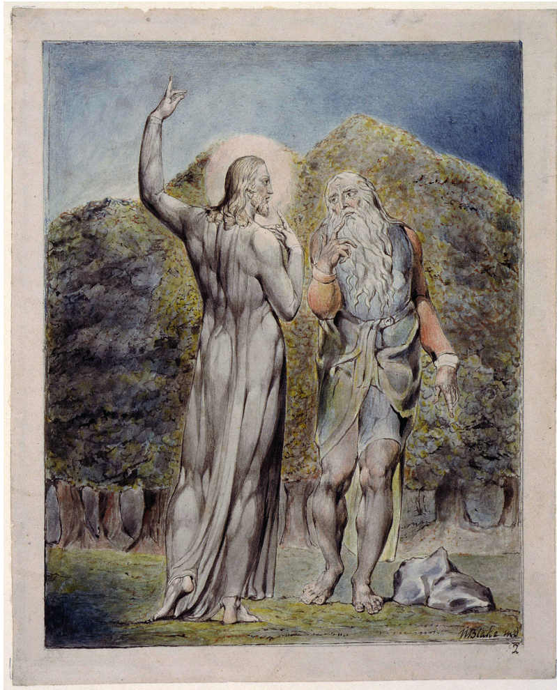
"The First Temptation—'Command that these stones be made bread.'" (1816-1825) by William Blake (1757-1827)