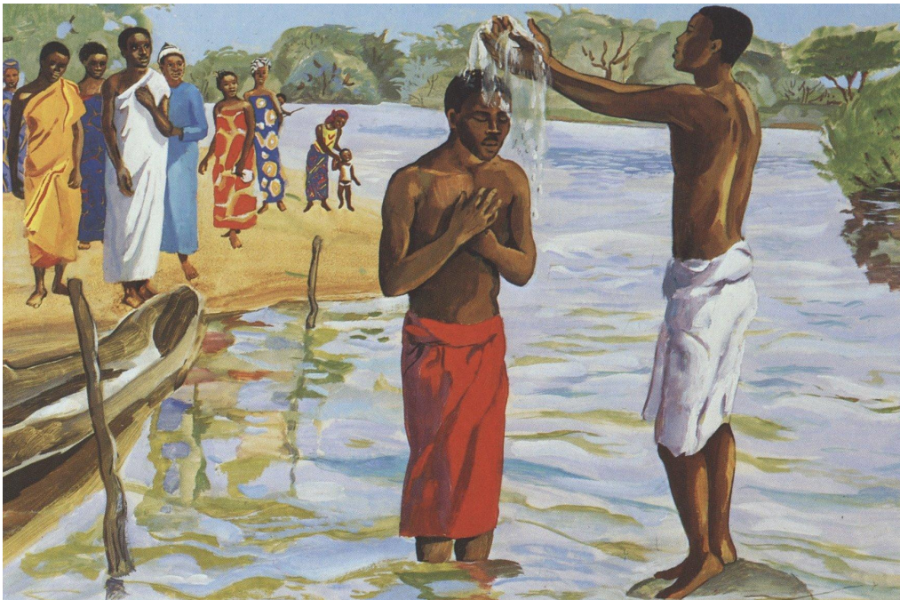
“John Baptizes Jesus” (1973) by the Jesus Mafa Project”