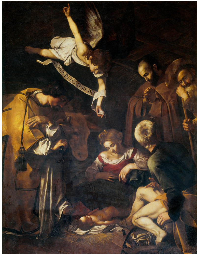
“Nativity with St. Francis and St. Lawrence” (1609) by Caravaggio