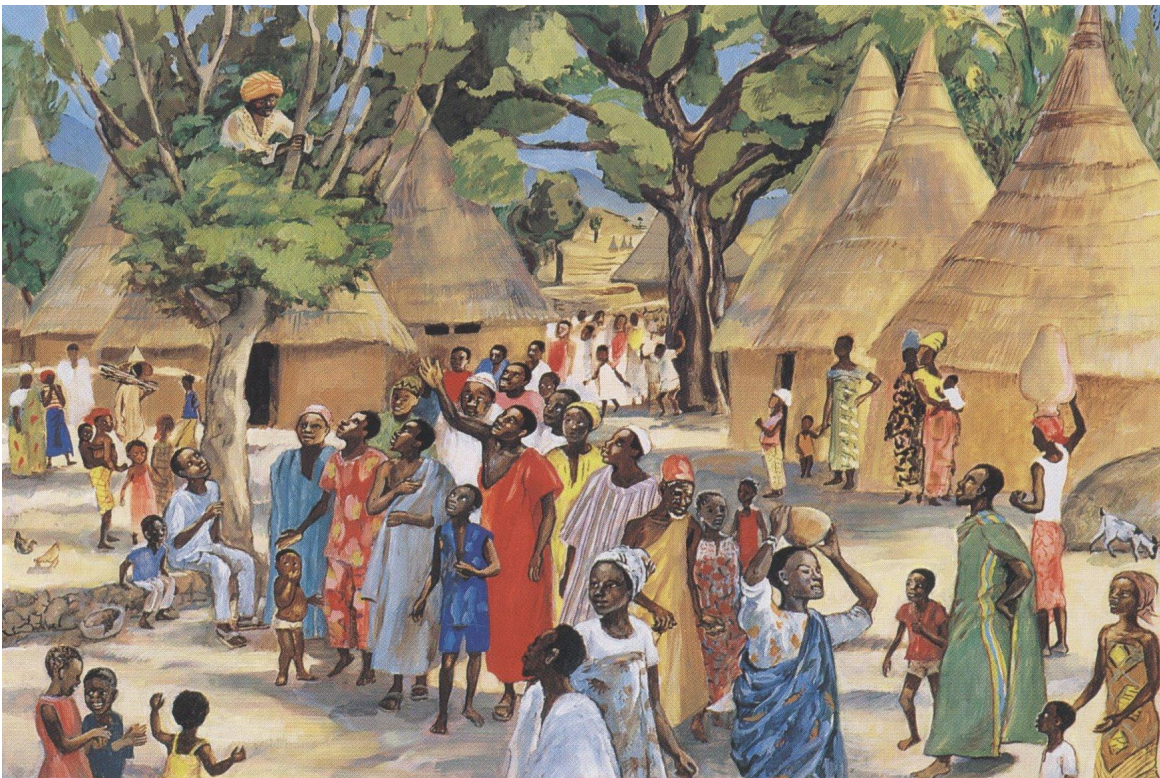
"Zaccheus welcomes Jesus" (1973) by Jésus Mafa