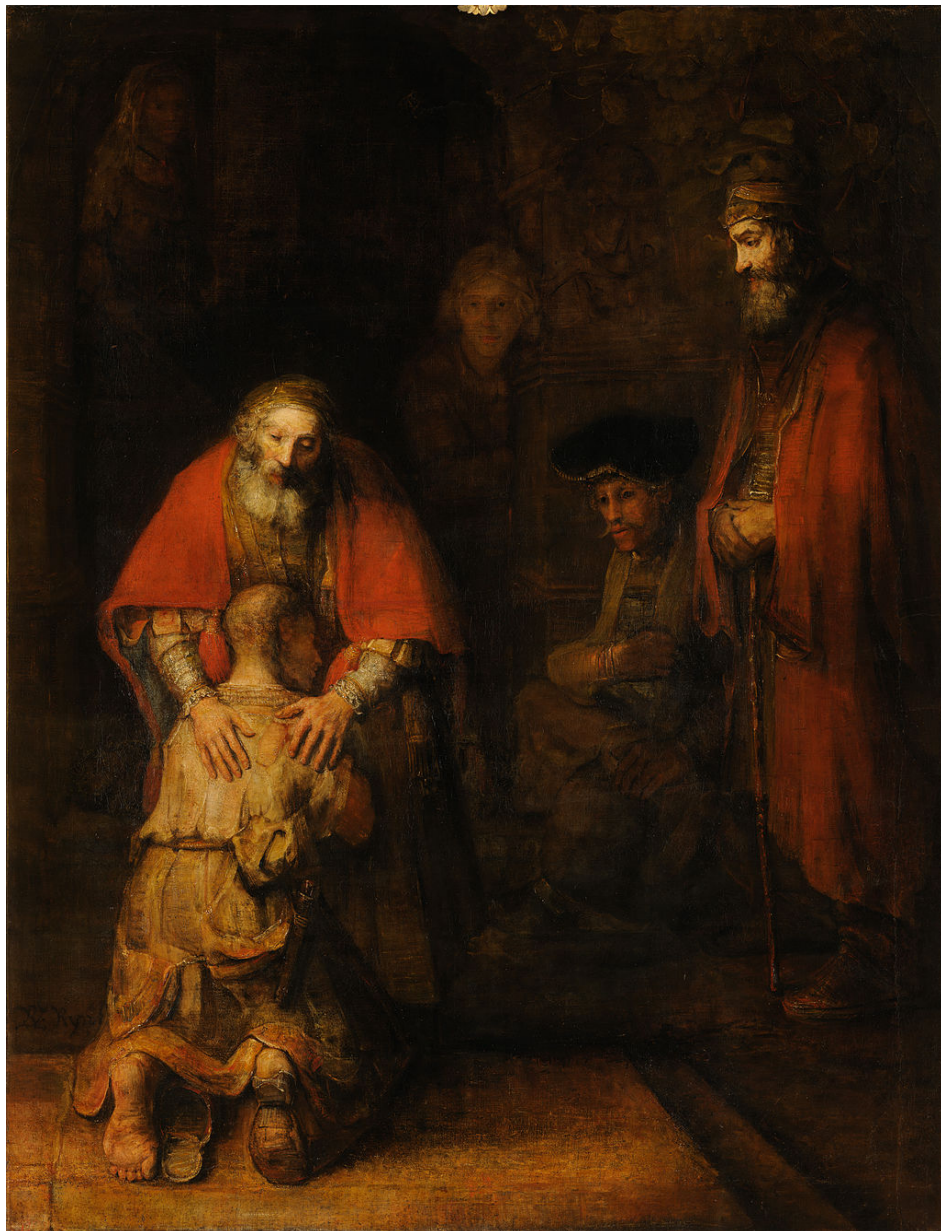
“The Return of the Prodigal Son” by Rembrandt