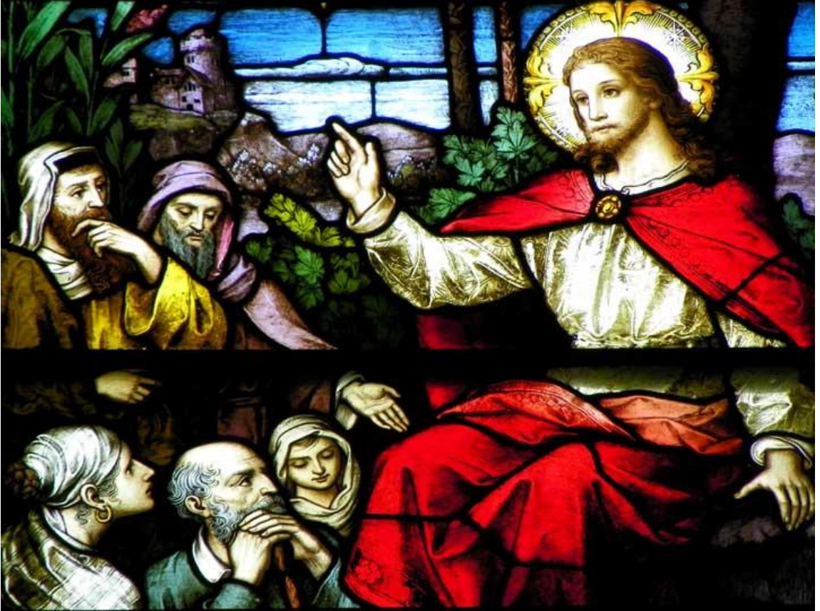
Jesus preaching to the Disciples St. Adalbert Basilica Buffalo, New York 1886